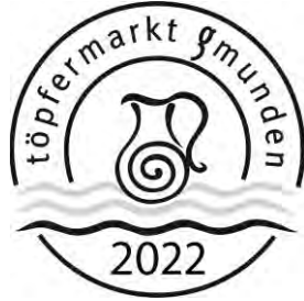
PHOTO OF THE POTTERY