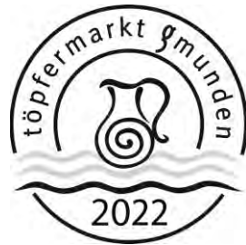
PHOTO OF THE POTTERY

Please do not send catalogs and photo sessions