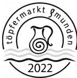
PHOTO OF THE POTTERY